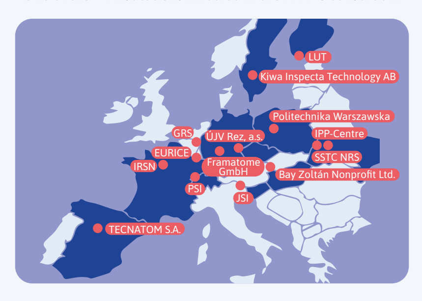
Where One of the 14 institutions involved in the APAL's consortium

The trainees can acquire cutting-edge knowledge on performing the integrity assessment of reactor pressure vessel (RPV) under pressurized thermal shock (PTS) with the aim to ensure its long-term operation (LTO).