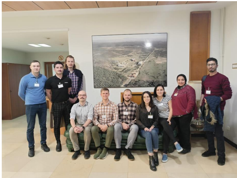
Fig.6: Students at the Workshop on the Structural Materials for Gen IV SMR Concepts, November 2023, Madrid, Spain.

The workshop has laid the groundwork for ongoing and future project endeavors. It was announced that similar collaborative and educational efforts will continue throughout the remaining stages of the project.