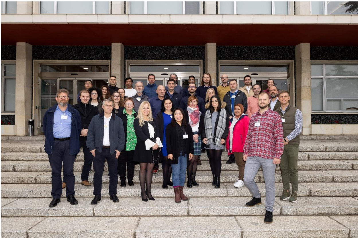
Fig. 1: Workshop participants; Source: ECC-SMART Project.

The workshop provided a comprehensive platform for exchanging knowledge on the latest developments in materials field for Gen IV nuclear reactors and, highlighted significant international collaborations and innovations in materials science applicable to nuclear energy.